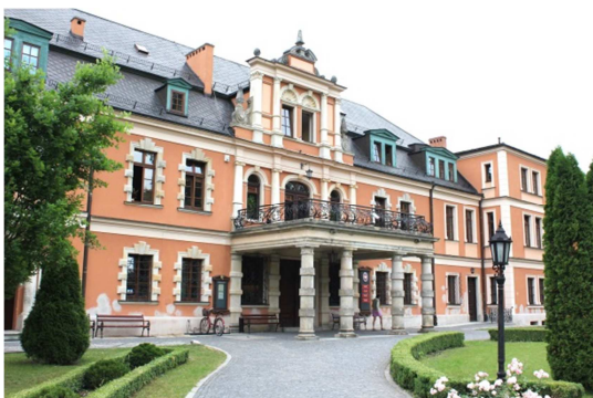
Figure 1. The manor house at Koberwitz, venue of Rudolf Steiner’s Agriculture Course of 1924.