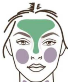
Figure 2. Areas where oiliness of skin were assessed and face mask were applied -- Green area: T zone; Purple area: cheeks [32].

With that all, we started interventions on all the participants the next day itself. Intervention group were given homemade egg white mask while controlled group were given commercialised egg white mask. Before applying the mask, participants were asked to clean their face to get rid of oil and dirt. The area where we applied the face mask for both gender are shown in Figure 2 . Due to the issues that some of the male participants with more facial hair, application of face mask around the mouth area may cause uncomfortable, pain and minor injury to that area as this is a peel off mask. Therefore, the mouth area was purposely avoided in both genders. The procedures of applying both types of mask on participants are as follow: